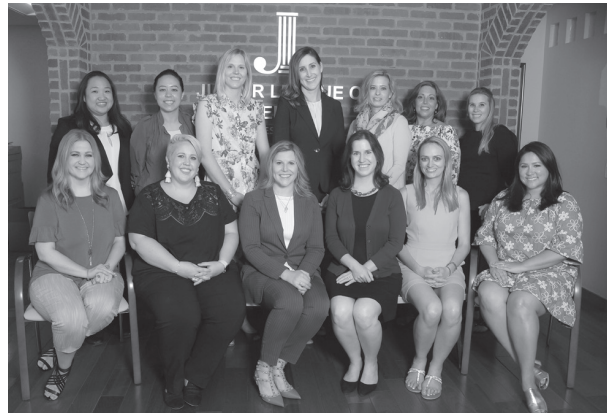
100th Anniversary Board of Directors